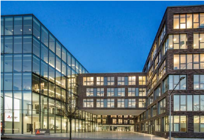
Consequently sustainable with renewable energies and intelligent energy control: the new building of the German Branch of Mitsubishi Electric