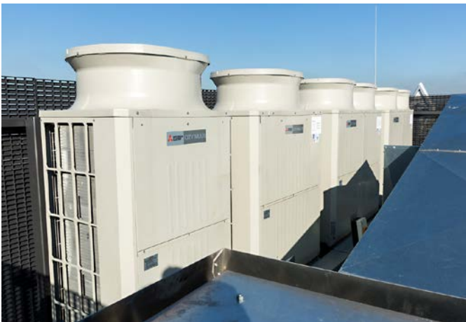
Thanks to the City Multi VRF-R2 system the energy consumption is reduced by 40 percent in the new building of the German Branch of Mitsubishi Electric